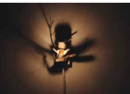
Johnathan Hopp Shadow Light A magical forest and one's darkest fears in the night lights shadows Natural wood, light bulb