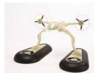
Shlomi Eiger P.C.B.T Printed circuit board toys Printed circuit boards