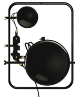
■ Dror Peleg Alloys DIY loudspeakers with a unique sound that is produced as a result of our sentimental material choices. Aluminum, gold, silver, stainless steel