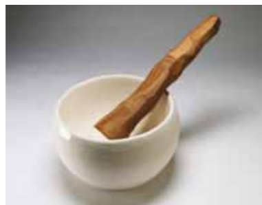
Shira Keret Paraphrase Form Follows Poetics: Using poems to define form, function and details Wood, porcelain, marble, sugar cube, spices, silver