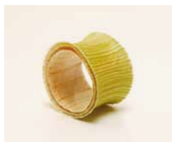
■ Yael Friedman Veggie Vegetable jewelry Garden vegetables