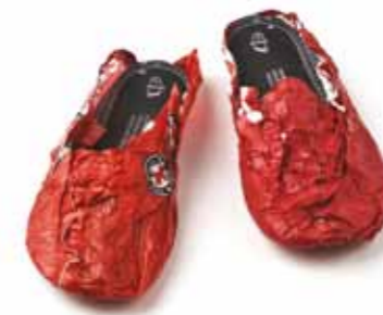
■ Galit Begas Foot Prints An experimental industrial process for manufacturing shoes from plastic bags Plastic bags