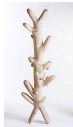
■ Tilit Segal Raayoni Vision of Dry Boards Design magic: industrial wood boards shaped into organic forms Wood scraps