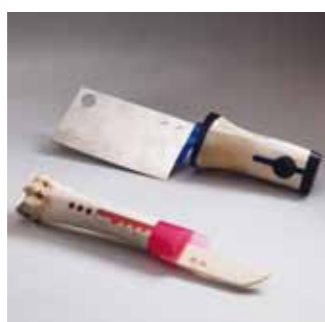
Omer Ackerman Make No Bones About It Bones as industrial raw material Animal bone, resin