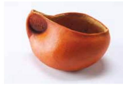
■ Ori Sonnenschein Solskin Peels Citrus fruit peels as tableware using experimental microwave technology Citrus fruit peels