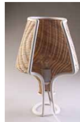
Gil Sheffi Local Material Weaved wicker sheets molded into a lamp shade - a twist on industrializing traditional handicrafts Wicker and plastic