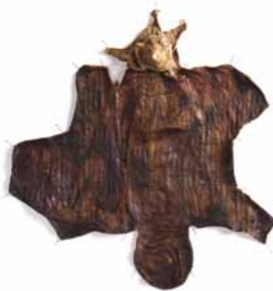
Roi Vaspi-Yanai Skins Examining eggplant skins Eggplant