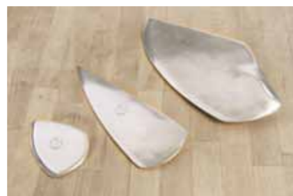
■ Hadar Snir Zor "The Butcher, The Cook, and The Diner" - a set of knives for modern carnivores Casted aluminum