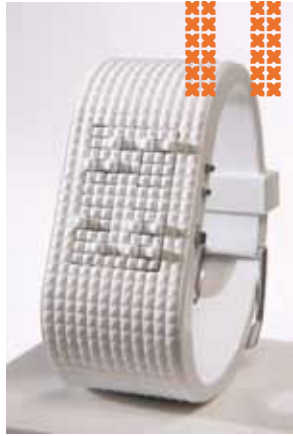
■ Noa Habas Duo, Sensing Time A braille wristwatch for the blind