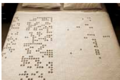
■ Ronit Landsman Between Emotional and Analytical Subjective pregnancy emotions quantified into a collective shared visual database