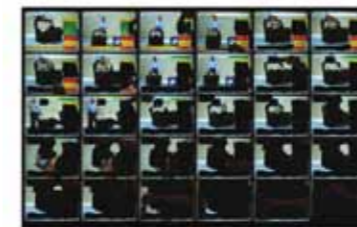
Liora Rosin Blackout A desperate attempt to protect myself from modern temptations Film