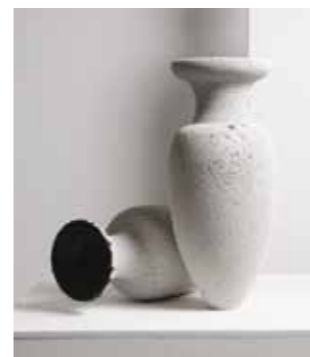
■ Etamar Beglikter Sealing Tar coated air block vases Air blocks, tar