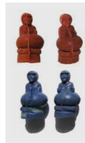
Yael Barnea Givoni Parting Line An examination of the aesthetics of imperfect molds