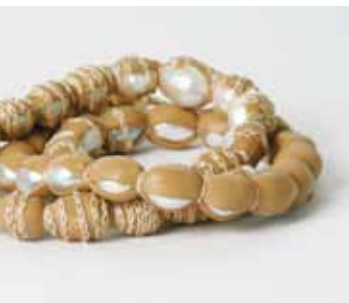
■ Tal Frenkel Alroy Pearless Another take on a classic status symbol – the pearl necklace Pearls, leather, thread