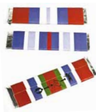
■ Liora Rosin Chewing Decorations Chewing gum wrappers as military decorations Chewing gum and paper