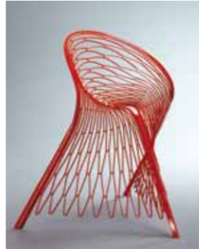
■ Ophir Zak Between the Lines 2D perforated metal sheet turned into a structural 3d form Sheet metal