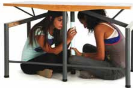
■ Arthur Brutter ProtecTable A classroom desk designed to serve as a shelter from earthquakes. Designed with the assistance of The Israeli National Rescue and Civil Defense. Laminated board, RHS beams