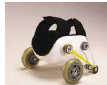
Nir Shalom Amigo Custom wheelchair for disabled dogs ABS, aluminum