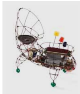
Koby Sibony Wire Frames A radio assemble from plastic scraps and a wire frame Plastic castaways, metal wire