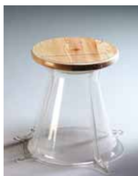
■ Inon Rettig RIK Vacuum formed stools structurally enhanced by wooden implants Wood, polypropylene