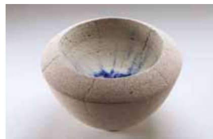
Maia Halter Turning Ytong Glazed tableware designed by using Ytong (industrial air blocks) Air blocks, ceramic glaze