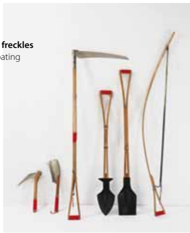
■ Itay Laniado Quick-Bend Tools A garden tool system made by using quick wood bending technique Wood, metal and rope