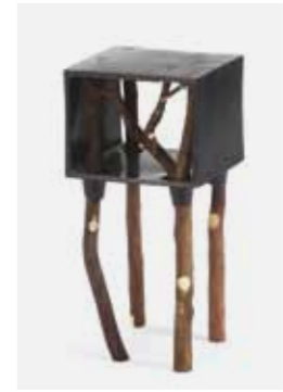
■ Adi Zaffran Weisler RAWtation Experiments with fusion of plastic rotation molding & organic raw materials Polypropylene, wood