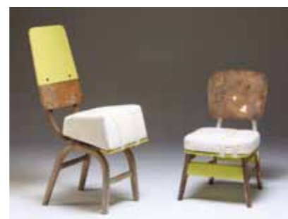
Noam Tabenkin Furniture Hospital Healing & re-animating damaged furniture