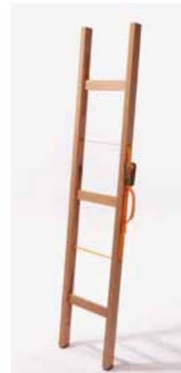
Itay Laniado Ratchet ladder A collapsible oak ladder held together by a ratchet strap Wood, ratchet