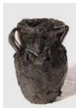
■ Daniel Azoulay Beautiful Ugliness Questioning aesthetic values by integrating dirty materials into decorative objects. Tar, hair, glass