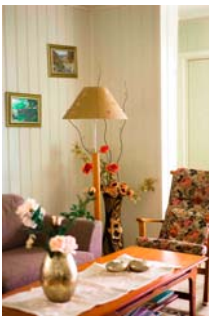
'Ashdod photography project': Lior Goldrat, Norway line