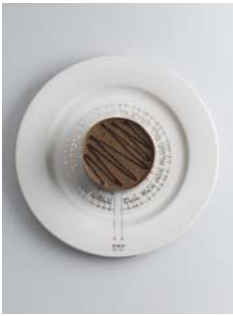
Ami Drach and Dov Ganchrow, Hotplate, ceramic and copper