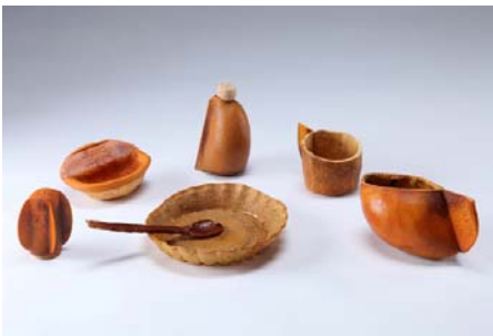
Ori Sonnenschein, Solskin peels, dried citrus peels