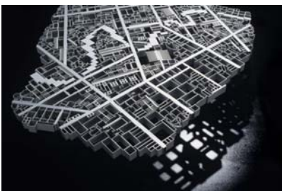
Ezri Tarazi, Baghdad table, extruded aluminum profiles