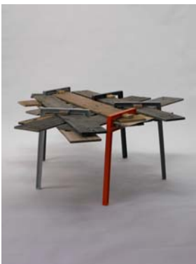
David Amar, 'Raymond', reclaimed wood and cast aluminum image