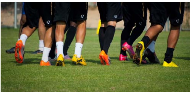
Sergei Litvinov, Team, printed on luster paper